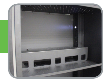
Secondary Shelf Option